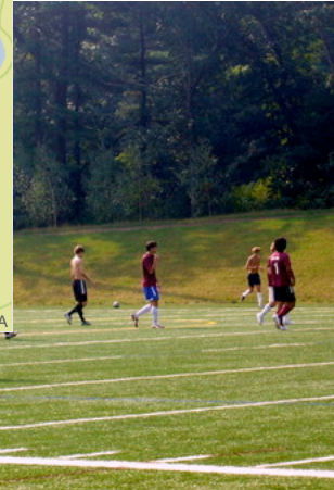
The Concord-Carlisle boys' soccer team returns this fall as the defending Division 2 state champion.